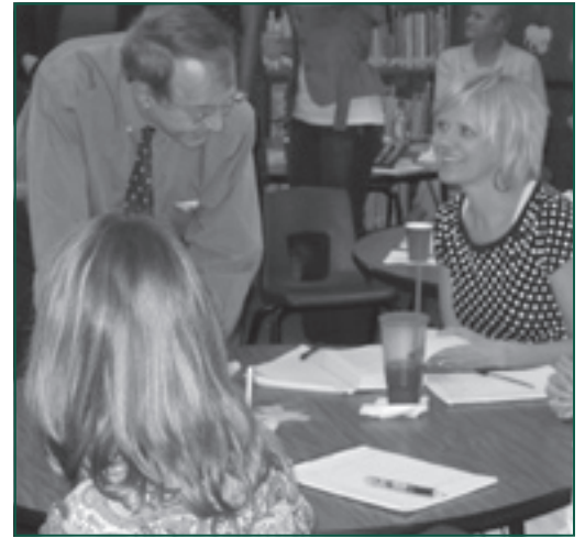
Jonathon Kozol visits with teachers from Campbell and Robberson Elementary Schools.

Parenting Wise, taught by staff from CFO, is a recognized best practices program that helps parents of at-risk students learn basic parenting