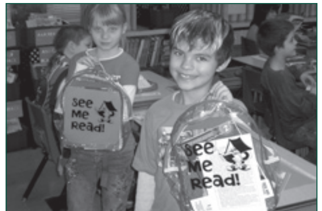
In December 2006, second graders at all 21 Springfield Title I schools received a new book and other materials to promote reading thanks to a grant from an anonymous donor advised fund held by CFO. Here, second graders from Pittman Elementary enjoy their new books.

For more information about donor advised funds with the Community Foundation of the Ozarks or one of its 40 regional affiliates, contact CFO at (417) 864-6199 or visit us on the web at www.cfozarks.org .